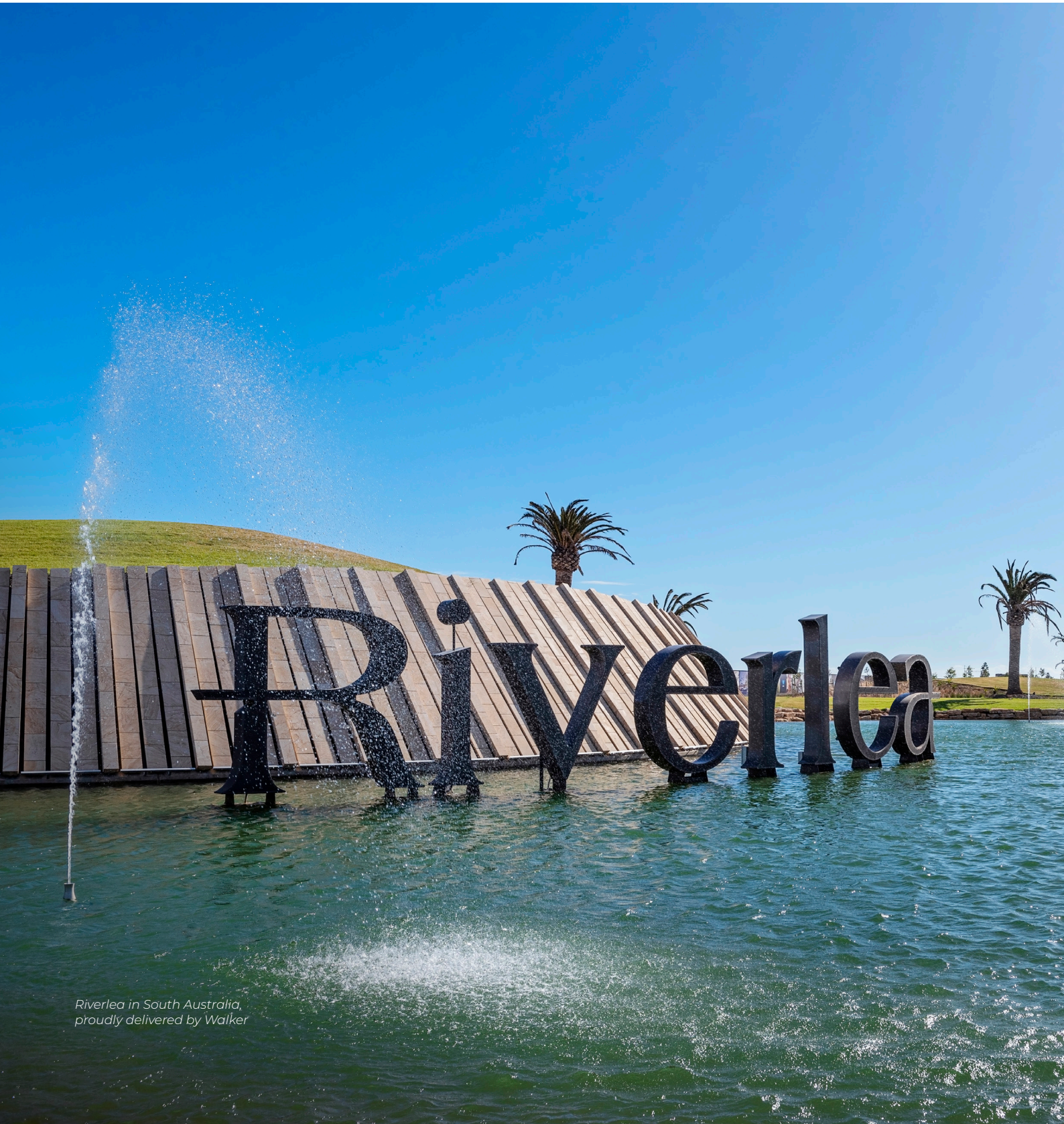
Riverlea in South Australia, proudly delivered by Walker

Walker have over 50 years of experience creating vibrant communities connected to infrastructure and amenities including Main Drive Kew in Victoria and Bluestone Mt Barker and Riverlea in South Australia.