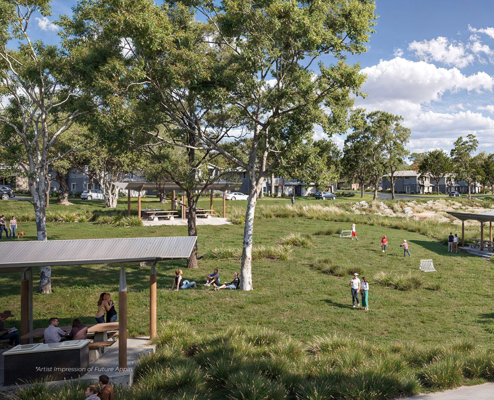
*Artist Impression of Future Appin