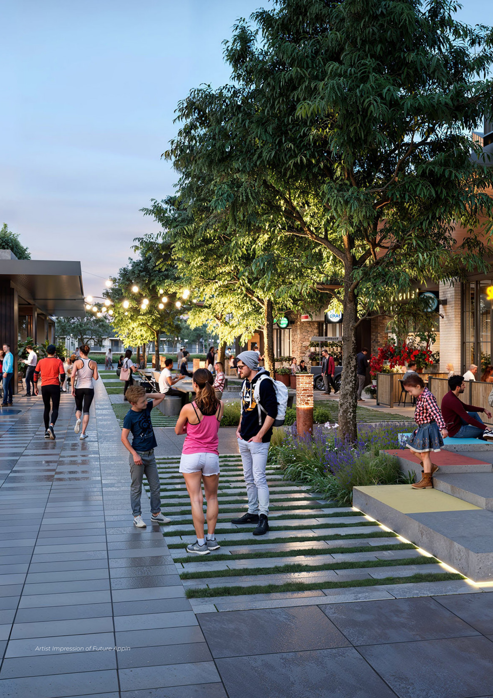
Artist Impression of Future Appin